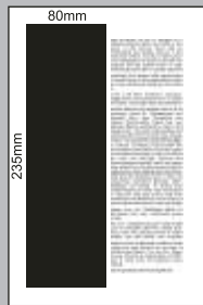
Vertical half page