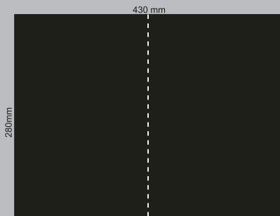
Bleed double spread