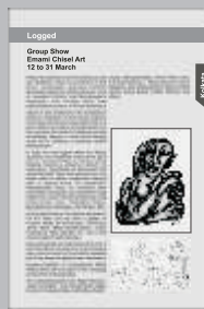
Advertorial Exhibition Listing